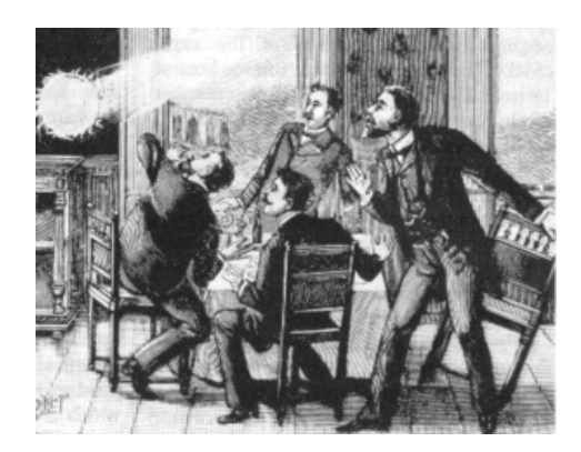
Fig. 1 The imagination of BL

The interpretation of the phenomenon of the ball lightning which the paper deals with is non-trivial and has a scientific background.