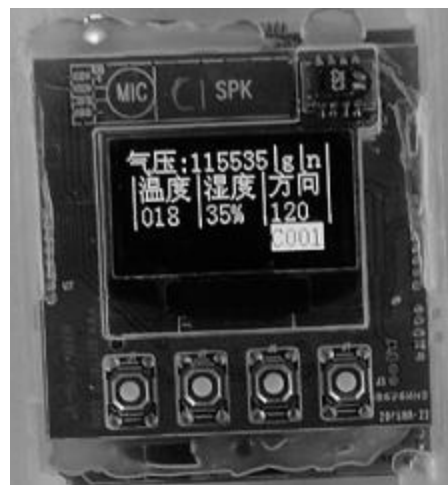
Fig. 2. WSN nodes

Data safety study: Many safety policies and mechanisms of traditional network are not applicable to the wireless sensor network. We should design a new network safety mechanism using the techniques of spread-spectrum communications, access authentication and authorization, digital watermarking, and data encryption.