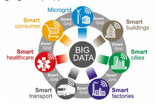
Fig.1. Examples of Big Data sources [1]

The idea of Smart Grid (SG) evolved in the late 20th century as a result of blackouts in the USA and other countries [1], which facilitated the development of SG and subsequently smart- buildings, cities, industry, etc. using chip-based devices (such as Smart Meters). Each of the smart entities generates, sends, receives and stores data; according to CISCO's prediction [2], in 2020, the number of data will be equal to 10<sup>18</sup>, which will intensify the already growing Big Data (BD) problem.