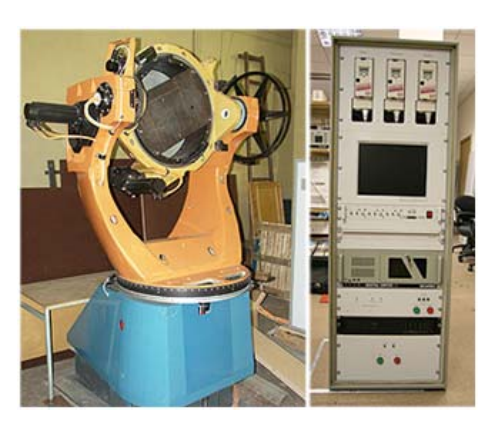
Fig. 3. Three-degree semi-natural modeling stand

The Fig. 2 shows the distribution of displacements and stresses in the shells of the stand when a dynamic load is applied to the stopper located in the middle of the right branch of the yoke. The dynamic load arises when the pitch ring hits the locking device, which serves as a limiter for the movement of the bench pitch channel. In the calculations, the dynamic load was converted to static load in accordance with the d'Alembert principle. The grid shows the finite element approximation of the test bench.