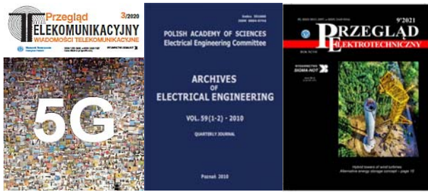
Fig. 7 The covers of journals

subject in question. The covers of the most important journals are shown in Fig. 7