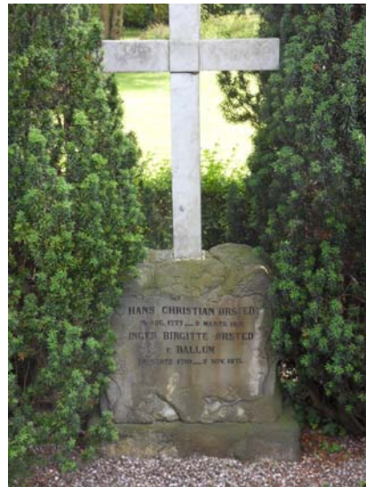
Fig. 5. The grave of H.C. Oersted [1]

Hans Cristian Oersted died in Copenhagen in 1851, His grave is in the Assisten Cemetery, where many Danish important people are buried (Fig. 5).