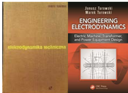
Fig. 6. The covers of the books [3,4]

Because of political situation in Poland in 19 th century the Polish activity in science and technology was not strong. The turn of 19 th and 20 th centuries brought some activities in electrical engineering, for example the inventions made by Michal Doliwo - Dobrowolski, who co-invented the three-phase electric current and invented three-phase induction motor and electric power transmission [3]. The real scientific activity in the area of applied electromagnetism can be dated for the 60-ties and 70-ties of the last century. The first book by prof. Turowski [4] opened the new area of study. After years prof. Turowski aided by his son released the English edition of the book (Fig.6) [5].