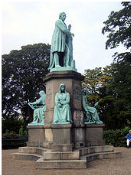
Fig. 4 The statue of H.C. Oersted in Copenhagen [1]

The Danish people honoured their great citizen naming by his name some places in Copenhagen and other Danish towns as well as some scientific buildings. To spread his name in the Universe the first Danish satellite received his name. In the Copenhagen park of his name the statue of Oersted was erected in 1880 (Fig. 4)