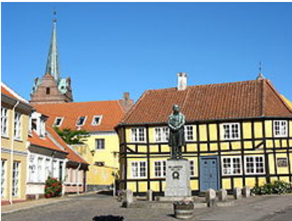
Fig.1 The monument of Hans Christian Oersted in his mothertown Rudkøbing [1]

Hans Christian Oersted was born in August 1777, in Rudkøbing, Denmark (Fig. 1).