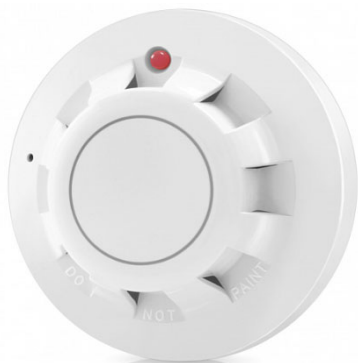
Fig. 1 – Smoke detector [9]

entering the evaluation chamber. The detector reacts to smoke by lighting the LED and switching the relay. Smoke is only detected if it "hits" the sensor directly. The alarm will end only after the detection space in the smoke sensor has been "cleaned".