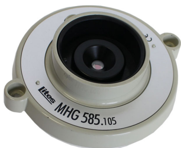
Fig. 2 - Flame emission detector [10]

Flame emission detectors are based on response to spectrum change. Infrared flame detectors and ultraviolet flame detectors belong to this category.