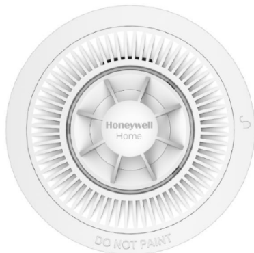
Fig. 3 – Temperature detector [11]

The temperature detector reacts to a change in temperature. This section includes point temperature detectors, linear temperature detectors, and thermostatic and thermodifferential detectors. The point temperature detector evaluates maximum and differential values based on temperature measurements with two thermistors. The linear temperature detector detects local differences in temperature and the density and refractive index of the air under the room's ceiling due to temperature fluctuations. The thermostatic temperature detector monitors the condition and reacts to a change in temperature by exceeding the specified fixed limit. The thermodifferential temperature detector monitors the condition and reacts to the rate of temperature increase over a specific time.