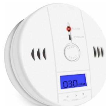
Fig. 4 – Carbon monoxide detector [12]

The carbon monoxide gas detector reacts to the presence of carbon monoxide.